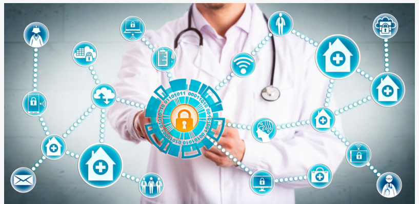
Person centered interoperability enables healthcare professionals to provide better care