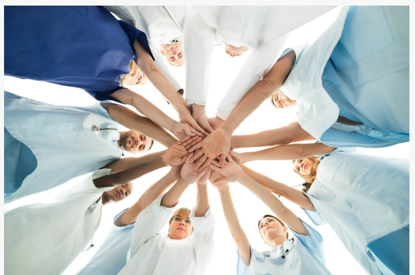
Hospitals SNFS communicating and collaborating through person centered messaging