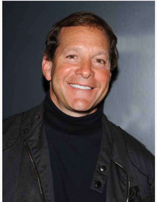
Steve Guttenberg, actor and LE&RN Honorary Board Member

To register, just visit LymphWalk.org . There you can join a team or form a new team of your own.