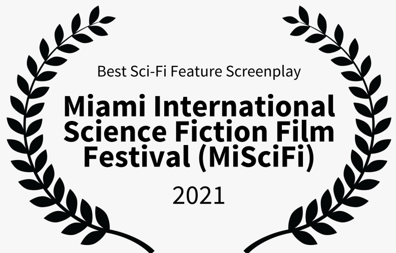
JoinWith.Me wins "Best Sci-Fi Feature Screenplay" at the Miami International Science Fiction Film Festival