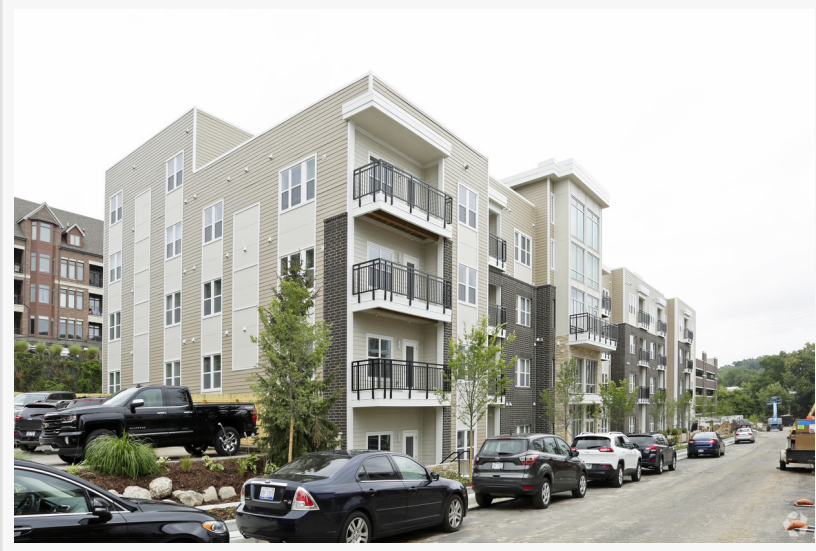
The Brix at Midtown, Grand Rapids, Michigan

Founded in 2010 by three partners who now have over 40 years of experience in commercial real estate, Triad Real Estate Partners strives to be the premier private client student housing and multi-family real estate brokerage company in the Midwest. The partners at Triad have closed over 375 transactions in 15 states covering nearly 30,000 multi-family and student housing units with an aggregate value of over $2.1 Billion. Triad has experience in all types of housing