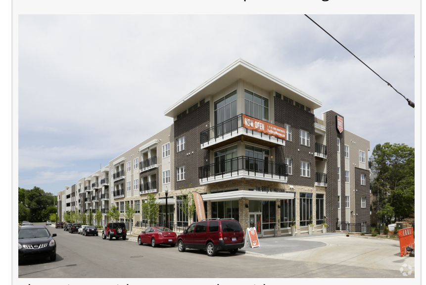
The Brix at Midtown, Grand Rapids

including affordable housing, conventional market-rate multi-family, and student housing. Triad is headquartered in Chicago's Downtown Loop.