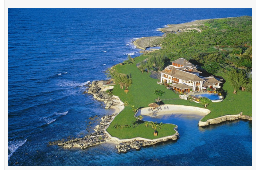
Fortlands Point Jamaica