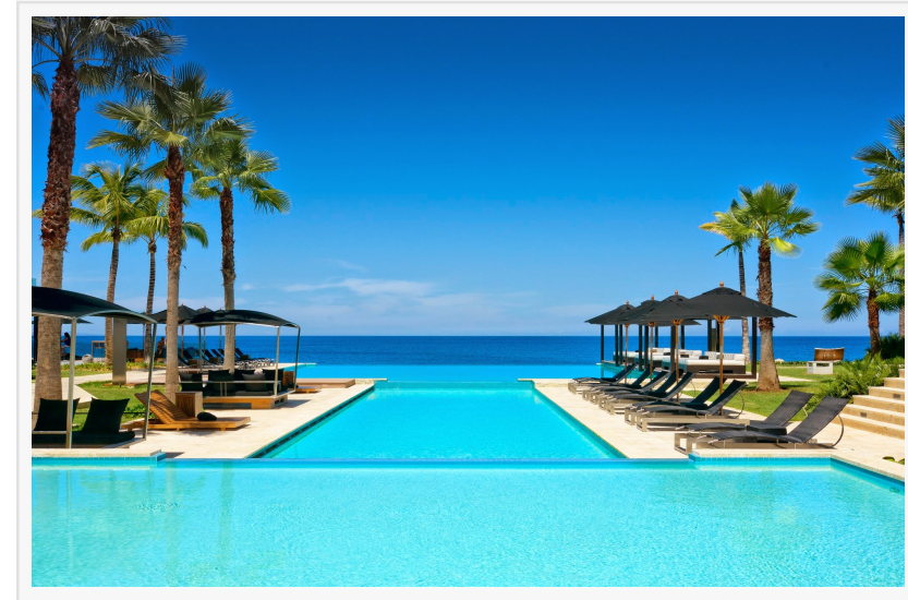
Dominican Republic Luxury Villas

1) Turks and Caicos 2) Barbados 3) Italy 4) Tayman 5) Jamaica 6) The Bahamas