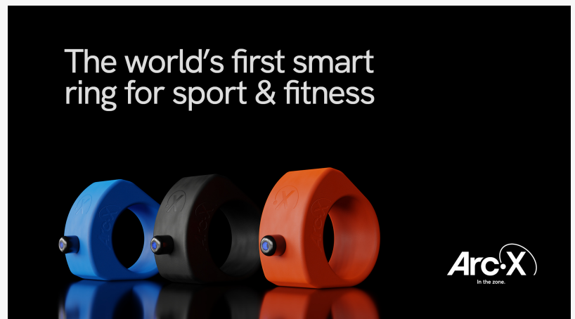
ArcX smart ring for sports and fitness

ArcX is made from medical grade silicone and houses a micro joystick inside a water and shock proof inner case. The inner case can be swapped among different sized rings or a watch type strap that allows the user to attach the device to a handlebar, paddle or other piece of sports equipment. The ring boasts an impressive 20 day stand by with a battery that delivers five days of normal use from a one-hour charge time, plus it's waterproof to IP67 standard and drop tested from 5 1/2 ft / 1.7 meters.