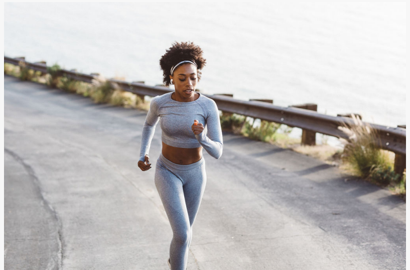
Girl running using her ArcX to change the song on a playlist