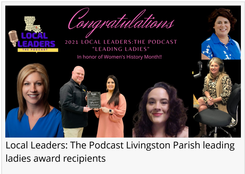
Local Leaders: The Podcast Livingston Parish leading ladies award recipients