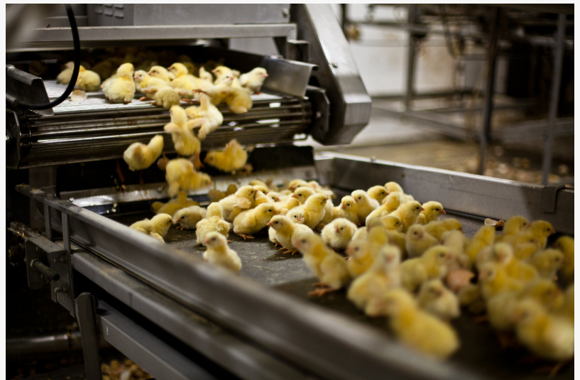
Viewed only as a commodity by the industry, newborn chicks await their fate.

"The practice of male chick culling by industrial egg producers is a violent, unnecessary step in an already cruel industry. It's time for legislators to act swiftly to ban this despicable slaughter and for U.S. egg producers to immediately stop the avoidable killing of day-old chicks," says Núñez.