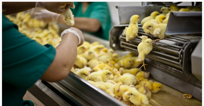
Chicks being sorted by workers moments after birth.

LOS ANGELES, UNITED STATES, March 30, 2021 /EINPresswire.com/ -- Animal Equality has launched a campaign in the United States to draw attention to the widely unknown practice of killing male chicks as soon as they are hatched, known as chick culling. Billions of birds across the globe face death on the day they are born simply because their lives are not considered profitable. In the U.S. alone, over 260 million male chicks are killed each year. This means about 30,000 freshly hatched chicks die every hour.