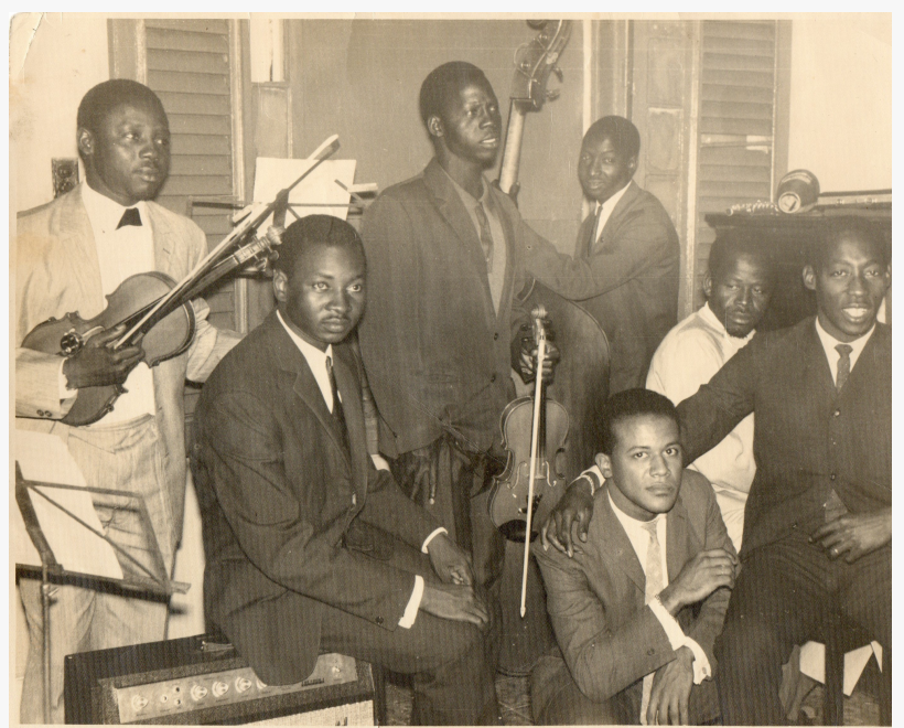
Maravillas de Mali