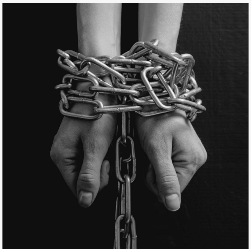
Person in Handcuffs

*Any profits or proceeds will be donated to the Robin Foundation www.Robinfoundation.org *