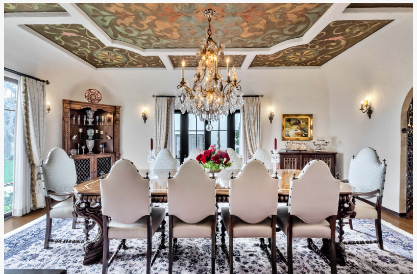
Entertain with a flourish against original details