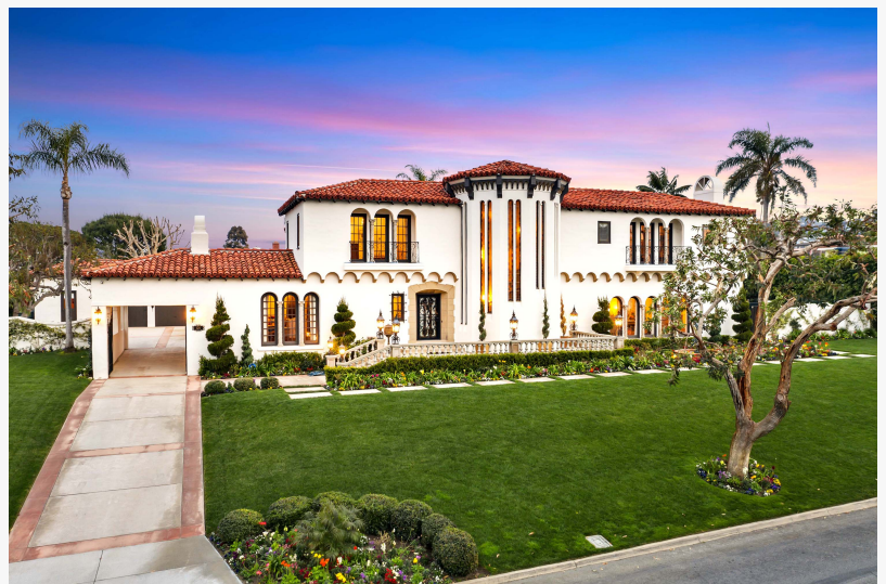
Classic 1920s Italian-style estate

scheduled to be held on May 7–12 via Concierge Auctions' online marketplace, ConciergeAuctions.com , allowing buyers to bid digitally from anywhere in the world.