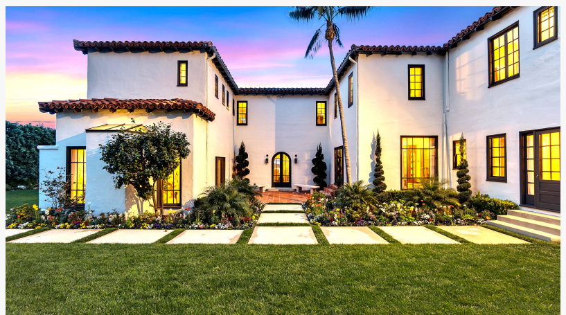
Private 3 lot property with impeccable landscaping