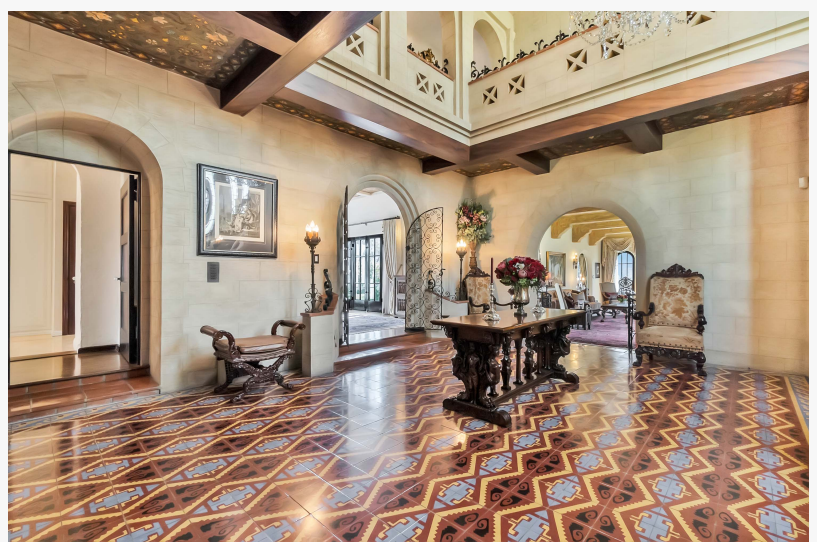
Expert craftsmanship throughout

This estate is located in Redondo Beach's highly-desirable Hollywood Riviera, a neighborhood which overlooks the Pacific Ocean from the foothills of the Palos Verdes Peninsula. Redondo Beach is famous for its circular infinity pier and white sand beaches that invite diving, fishing, beach volleyball, and surfing. Along with its neighbors Hermosa Beach and Manhattan Beach, Redondo's active lifestyle and Mediterranean climate make it one of the most sought-after Southern California destinations. The Clifford Reid House sits just a half-mile stroll from the beach, and is in close proximity to Riviera Village, a vibrant area filled with world-class dining & shopping. Plus, convenient freeway access means that all that the greater Los Angeles area has to offer is within easy reach. This European villa represents the best of all worlds, since privacy, nature, and the benefits of city life can all be enjoyed at the