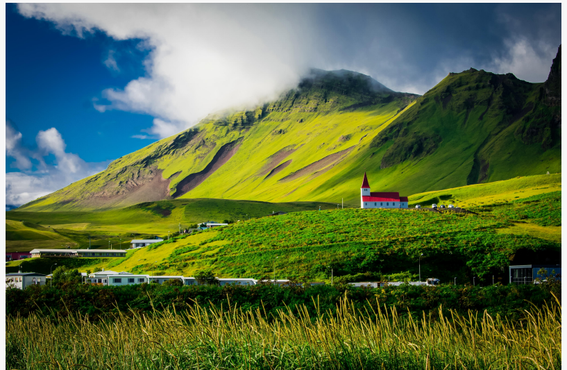
The national church of Iceland is organized into 266 congregations around the country, the photo shows Vikurkirkja, the local church in Vik, the southernmost village in Iceland.