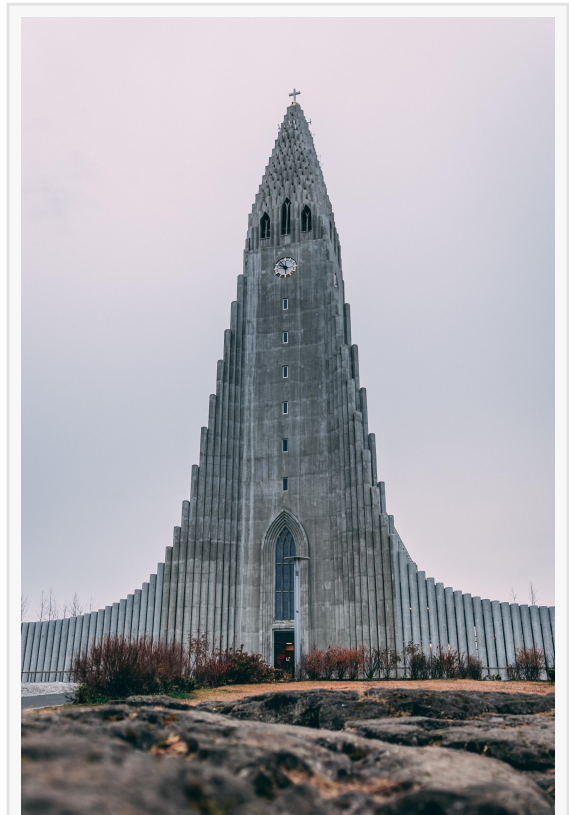
The national church of Iceland is organized into 266 congregations around the country, the photo shows Hallgrímskirkja situated on a hilltop near the centre of Reykjavík.