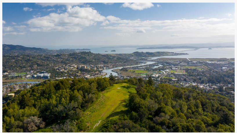
360-degree panoramic views of San Francisco, Marin County, the Bay and Bridges, and Mt. Tamalpais

two exit fire trails; access to over 80,000 acres of public open space, with a looped hiking trail around the property's base; five on-site water wells, one of which has been developed for construction; a vested entitlement which includes large areas for landscape and support structures for exterior areas that stretch beyond dwelling improvements, plus a large pond, access roadways, vineyards, water runnel, belvedere structure, horse corrals, pathways, and plantings; and short construction activation time frames through the Marin County Community Development Agency and Marin County Building Permit agency.