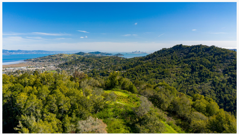
140ac ridgetop parcel, 12 miles from the Golden Gate Bridge

Additional features include a gated entry; power, water, gas, internet, and telephone access at the base of the property; a fully fenced inner land area containing all the building envelopes and