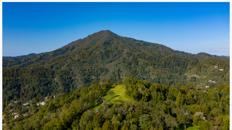
No other Estate Property in the Bay Area compares