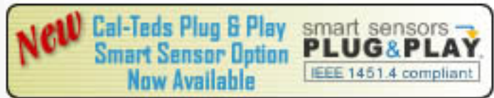
CAL-TEDS Plug & Play Smart Sensors Icon

The LCA-9PC ( Load Cell Amplifier Signal Conditioner ) can be operated next to the sensor with 4-wire hookup or at distances up to 1 km (3300 feet) with 6-wire hookup. An onboard 87.325 k \Omega resistor allows easy shunt calibration at the push of a button. Provision is also