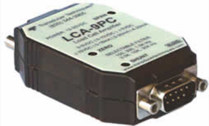
LCA-9PC Module - Load Cell Amplifier Signal Conditioner