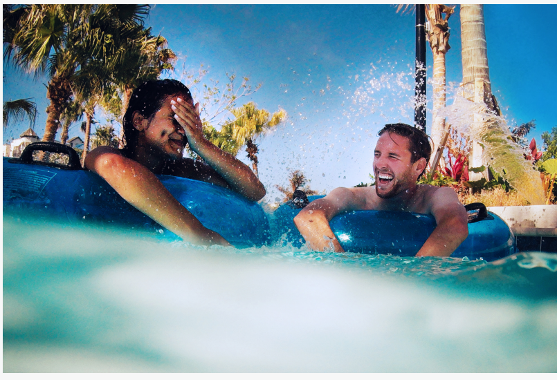
Fun times for the family!

Sign up for our Virtual Event starting Monday 5th April, 2021.