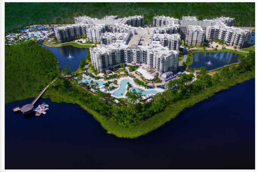
Don't miss out on this opportunity!