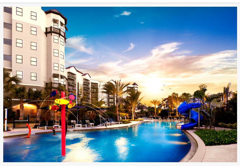
Amazing property for sale.

Orlando property is being offered as the latest addition to Ideal Homes International's portfolio of properties for sale in Florida. These Orlando properties are being offered for sale at