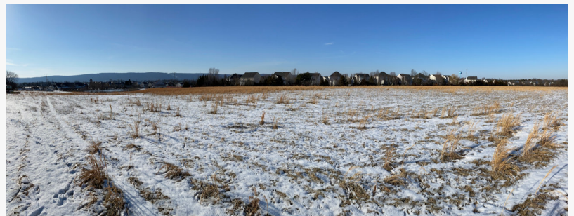
Undeveloped Commercially Zoned Land in Loudoun County, VA, set for Auction

This press release can be viewed online at: https://www.einpresswire.com/article/537900455