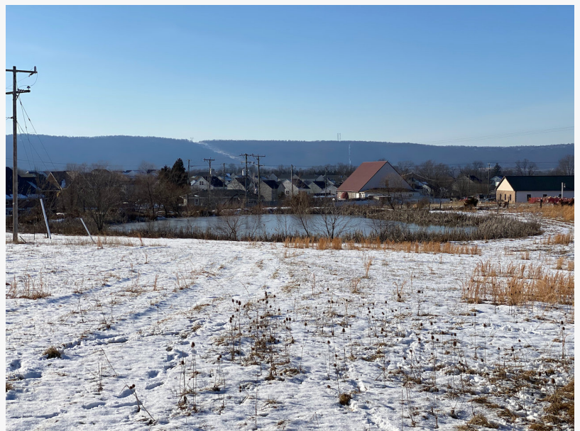
Undeveloped Commercially Zoned Land in Loudoun County, VA, set for Auction