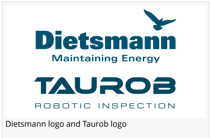
Dietsmann logo and Taurob logo

environments and has already been operating in offshore environments for some major International Energy Companies. The robot is equipped with sophisticated sensors that gather 24/7 real-time equipment data, which –through interpretation and algorithms– allow for extremely effective predictive maintenance. Dietsmann is a major international maintenance specialist in the energy industry and a leader in advanced predictive maintenance technology.