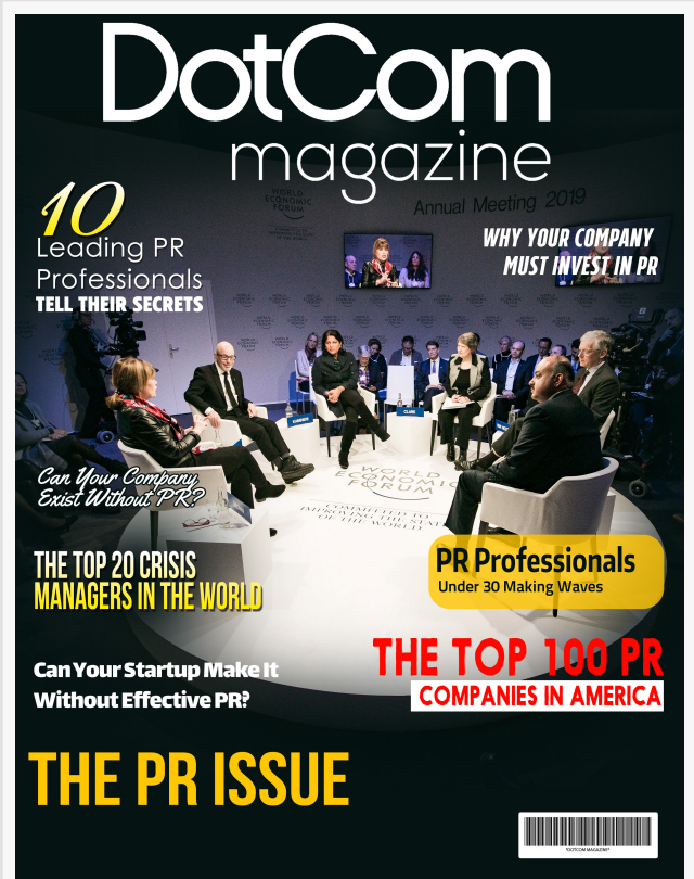
The DotCom Magazine Entrepreneur Spotlight Show