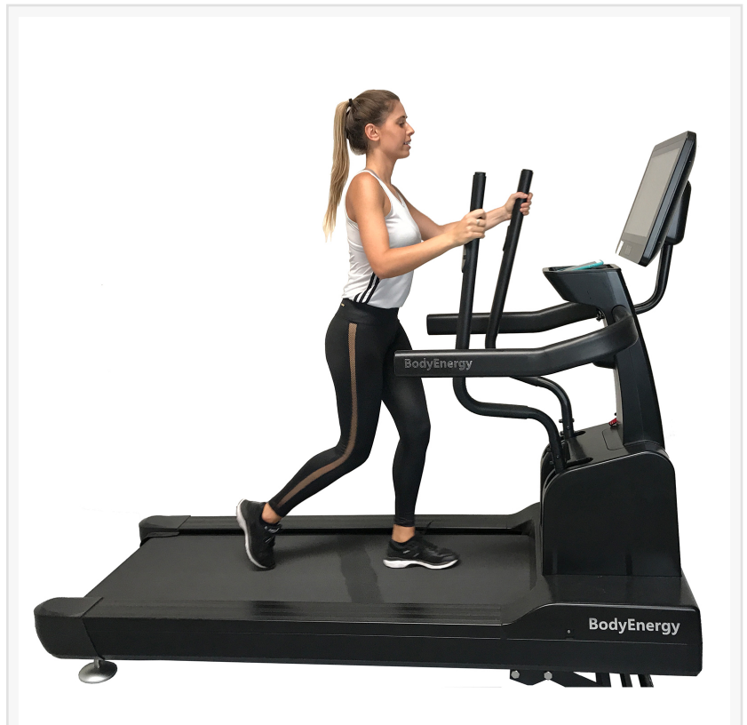
BodyEnergy treadmill: A New Way To Run