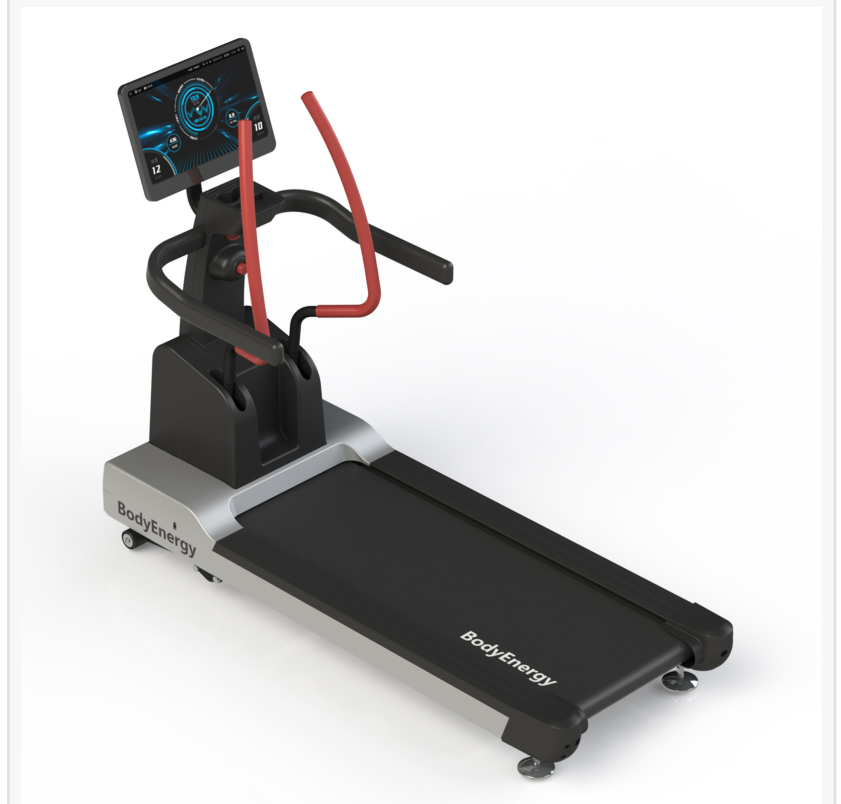
BodyEnergy treadmill: A New Human-Powered Treadmill for Safer, Greener, and More Complete Exercise