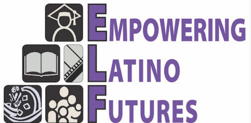
Logo for Empowering Latino Families - Non-profit