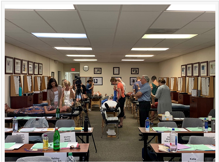
Students in an ACT class drilling the techniques they learn