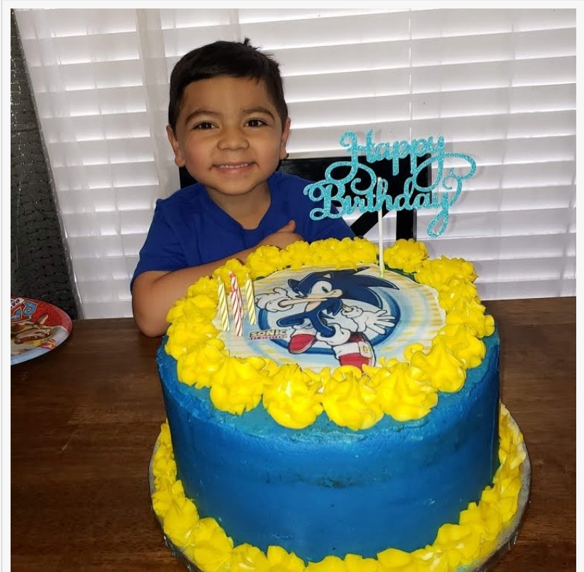
Akki's Cupcakery Donates to Critically Ill Children