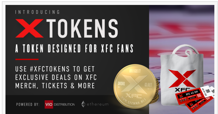
XFC Coin $DKMR

DKMR Partners with Sidechain Recording to Produce The Most Epic Theme Songs In MMA