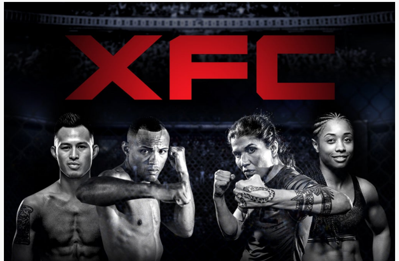
XFC Tryouts $DKMR

On March 26th DKMR announced that Sidechain Recording has produced the epic theme song