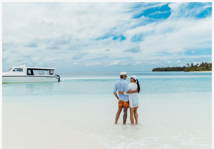
Indulge yourself with a sandbank trip towards the equator.

The Equator Experience starts with an adventurous boat cruise and journey to 0°00'00.00N. Enjoy a refreshing coconut drink fresh from the shell and dine on tasty canapés such as fresh tuna sashimi, smoked salmon, sushi and avocado and egg wraps. Head to the Equator and enjoy the breathtaking beauty of the turquoise waters, the warm sunshine and the sheer tropical landscape. Upon reaching the coordinates 0°00'00.00N, the boat captain highlights the GPS reading on the radar showing that they have reached the Equator. There is nothing left to do but jump into the inviting water of the