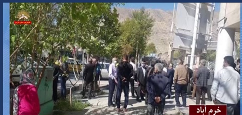
خرم آباد - Khorramabad