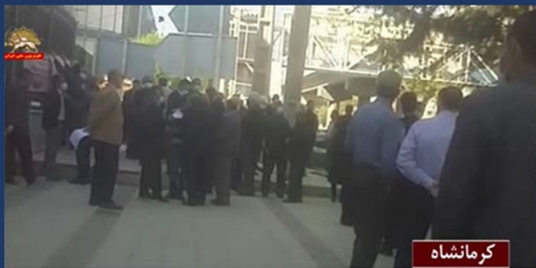
کرمانشاه - Kermanshah