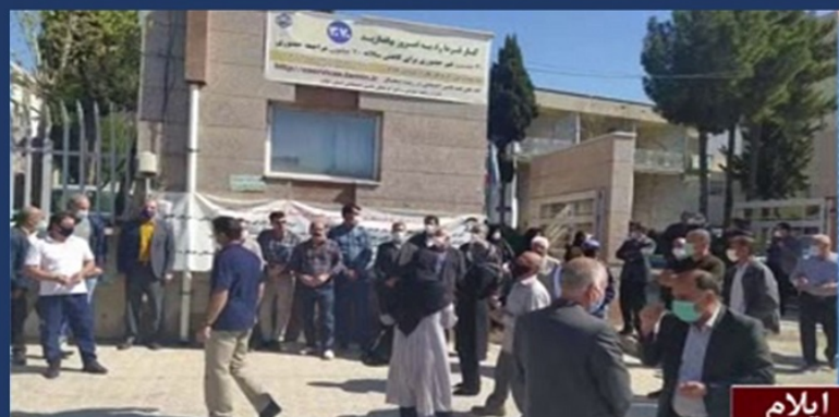
ایلام - Ilam