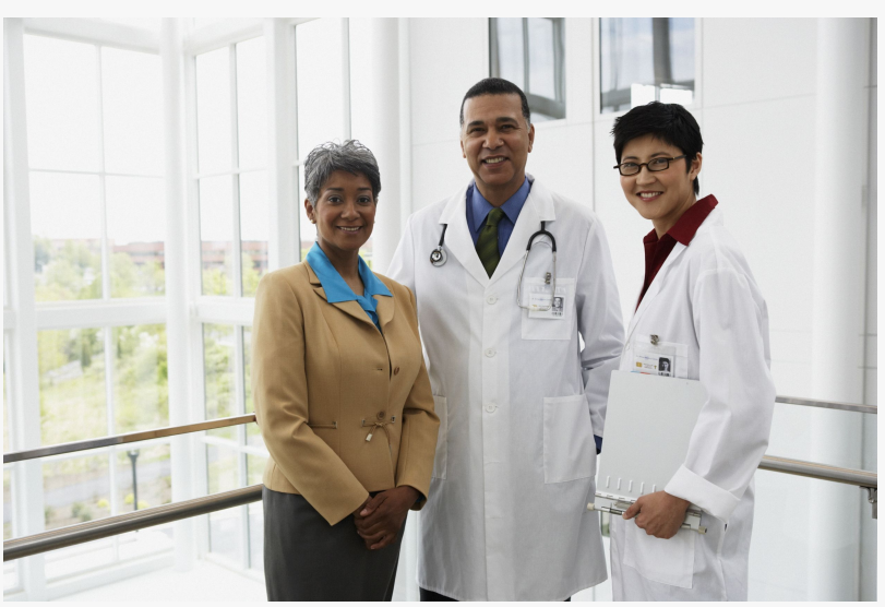
The Steinberg Law Group is affiliated with doctors around the country.

Connecticut, Florida, Texas and California. For more information about mesothelioma and asbestos-related lung cancer, call (888) 891-2200 or visit www.mesotheliomaoptions.com/contact/ now.