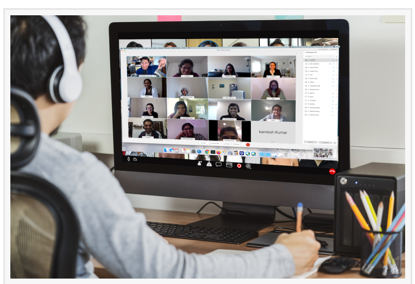
Training sessions take place online

NEW YORK, NY, UNITED STATES, April 8, 2021 /EINPresswire.com/ -- Mission:Residency, a medical education organization that specializes in guiding international medical graduates (IMGs) to secure residency in the United States, today announced its participation in 'Integrated Communication Medical Doc' (ICMD) Certification Training. In addition to