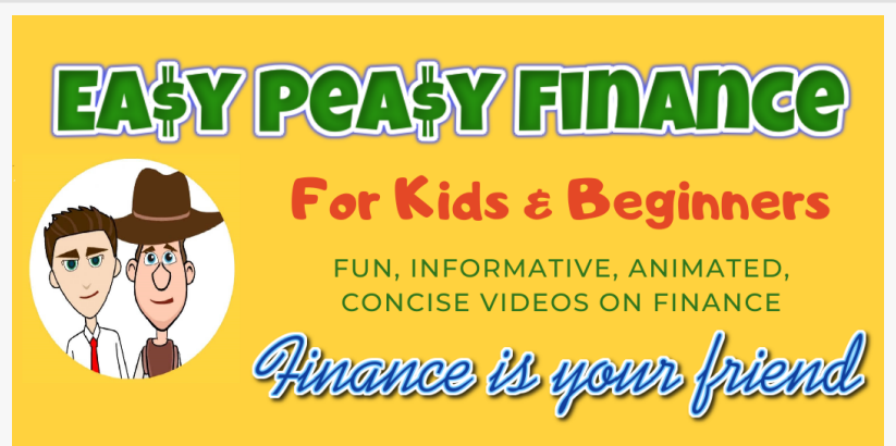
Easy Peasy Finance - Fun, Informative Financial Literacy Videos

Easy Peasy Money is a fun financial literacy book that helps kids and beginners discover the fun universe of Money and Budgeting by explaining complex personal finance concepts in a fun and engaging way for kids, tweens & teens. It covers all aspects of money – Earning, Spending, Saving, Investing, Borrowing and Budgeting through: - Beautifully illustrated, full-color pages to help kids grasp and retain information - Two lovable characters that make learning fun - Intuitive infographics to recap learning