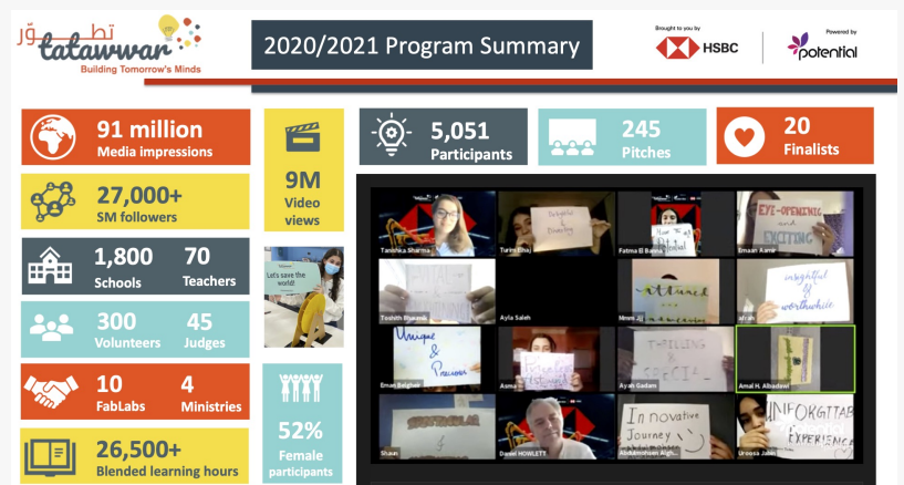
Tatawwar 2021 rollout summary