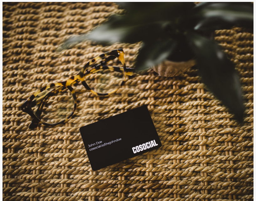
Cosocial NFC Stainless Steel Matte Black Card