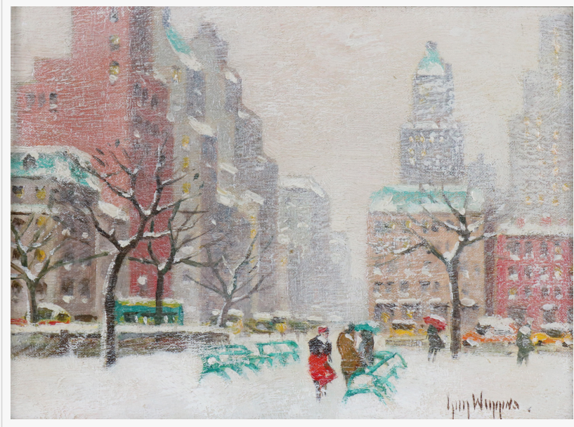
Oil on board winter view of Washington Square Park in New York City by Guy Wiggins (est. $10,000-$20,000).

Just as there is variety in the violin carvings, there is an exceptional group of 18th and 19th century lighting devices coming from a private New Jersey/New York collection. These pieces