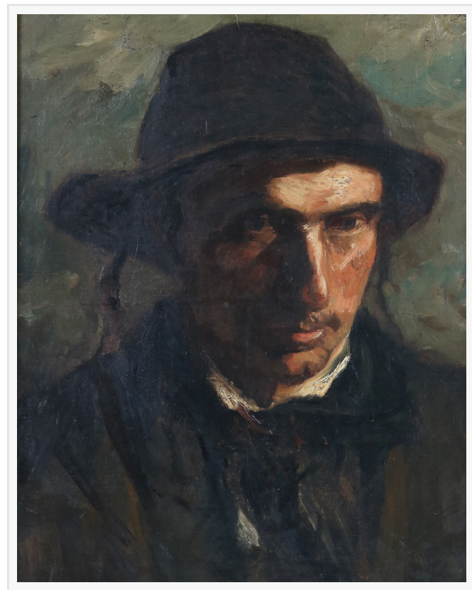
Oil on canvas portrait of a gentleman by Jozef Israels. The darker, somber tones of this work and the piercing eyes of the sitter draw the viewer into his soul (est. $10,000-$20,000)

International consignors contributed to the auction as well. A French collector consigned a fine ink drawing by Georges Braque of Diana the Huntress and Kees Van Dongen's watercolor of a man, while a New York/Italian family is selling a