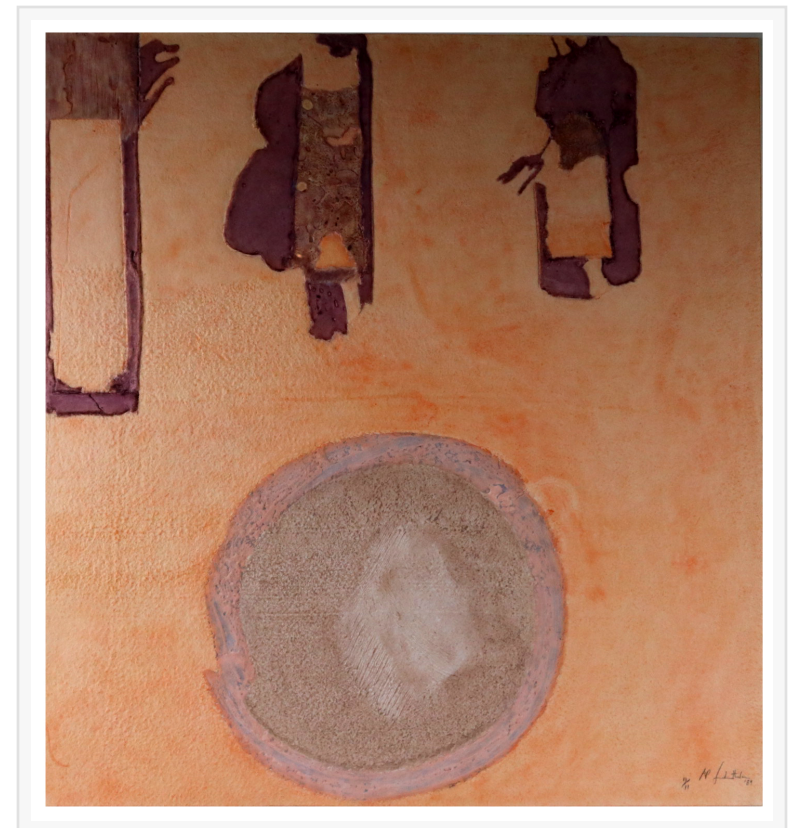
Abstract Mixografia on handmade paper by Helen Frankenthaler (est. $5,000-$7,000).

People can bid in absentia and online. An online preview is being held April 7th through April 22nd, at <a href="https://www.nyeandcompany.com">www.nyeandcompany.com</a>, <a href="https://www.nyeandcompany.com">www.nyeandcompany.com</a>, <a href="https://www.nyeandcompany.com">www.nyeandcompany.com</a>, <a href="https://www.liveauctioneers.com">www.liveauctioneers.com</a>, <a href="https://www.bidsquare.com">www.bidsquare.com</a> and <a href="https://www.invaluable.com">www.invaluable.com</a>. Anyone looking for additional images, condition reports or info