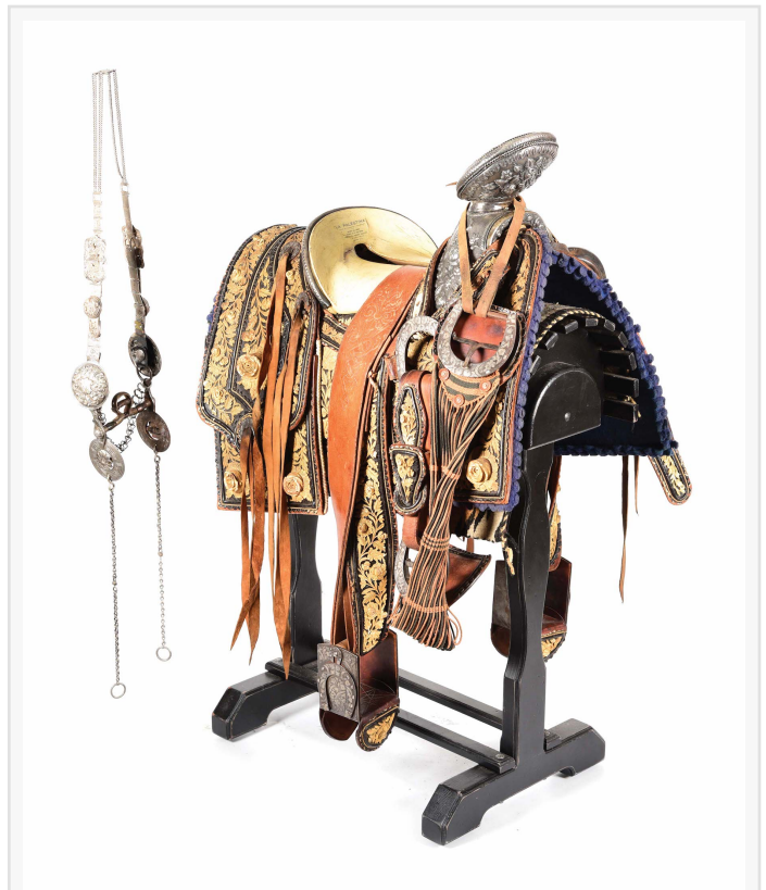
Late-19th-century Mexican silver charro saddle with bridle made by Fernando Perez of Mexico City, of a type used by 'charrería,' the highly skilled mounted performers in Mexican rodeos. Superlative condition. Estimate $5,000-$8,000

This press release can be viewed online at: https://www.einpresswire.com/article/538133964