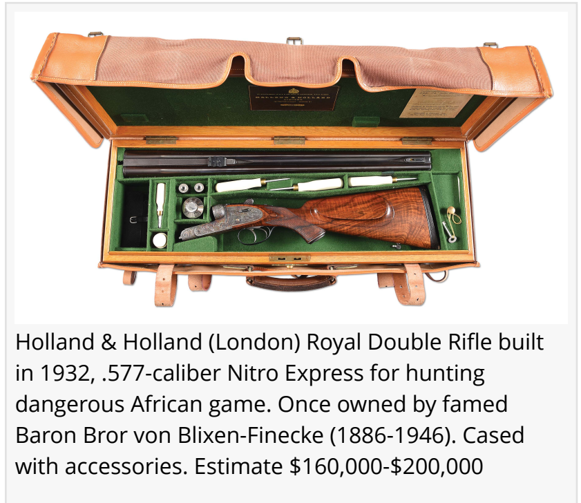
Holland & Holland (London) Royal Double Rifle built in 1932, .577-caliber Nitro Express for hunting dangerous African game. Once owned by famed Baron Bror von Blixen-Finecke (1886-1946). Cased with accessories. Estimate $160,000-$200,000