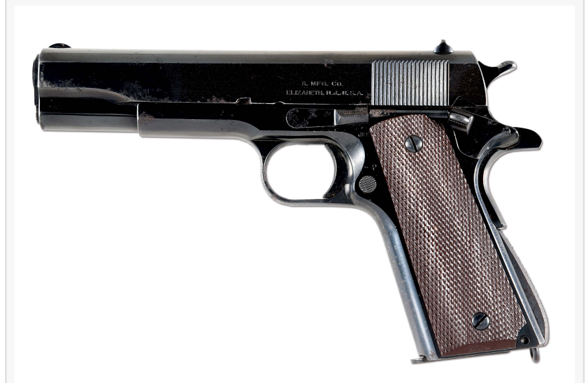
Rare, original-finish Singer Manufacturing Co., 1911A1 military pistol, .45 ACP, one of only 500 made in 1941 under Educational Order W-ORD-396. Estimate $80,000-$125,000

In the Military Firearms category, there are scores of premium-quality entries, but two lots, in particular, stand out as superstars. First, there’s an exceedingly scarce and desirable Colt/Armalite AR-15 Model 01 machine gun that fires .223 Remington-caliber ammunition. An early and unaltered precursor to the iconic M16 machine gun, it is fully transferable, contingent upon BATF approval prior to conveyance. Estimate $40,000-$80,000. The other high-flier of the group is a rare, original-finish Singer Manufacturing Co., 1911A1 military pistol, .45 ACP and one of only 500 made in 1941 under Educational Order W-ORD-396. With perfect manual mechanics