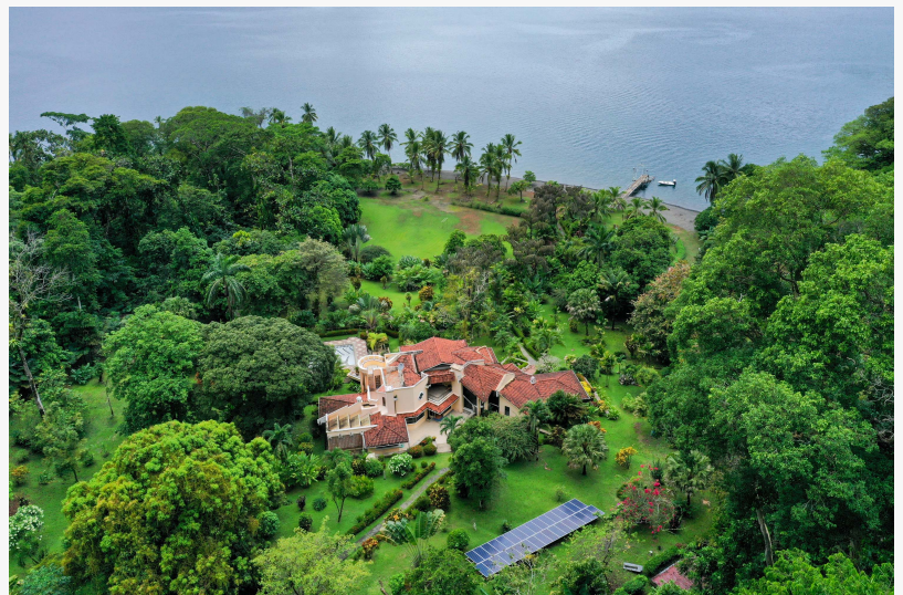
Surrounded by rare wildlife and breathtaking nature, Punta Encanto is a truly private Costa Rican escape.