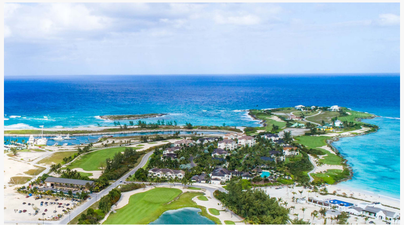
Luxury villas in award-winning Bahamas resort