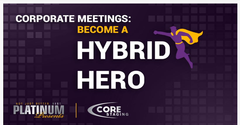
Corporate Meetings: Become a Hybrid Hero

FORT WORTH, TX, USA, April 7, 2021 /EINPresswire.com/ -- The concept of hybrid is not a new one and almost everyone is familiar with it. The literal meaning of hybrid is something that is composed of two or more elements to achieve a better outcome. For example, a car using both gasoline and electricity as a more efficient alternative on the road. Well, this is a terrific example of the hybrid concept... but what does that mean for corporate meetings? What do we mean when we say "Hybrid Hero"? Are we talking about a superhero with different kinds of powers? Science-fiction? This concept is very real. We are talking about being a hero of re-entry. In other words, championing the hybrid conference as we all safely return to live events.