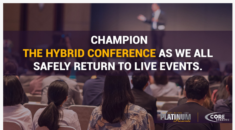
Champion the Hybrid Conference

Ever since the pandemic arrived in 2019, we have watched as almost every business has shifted to virtual mode. As people continue working from home rather than having face-to-face