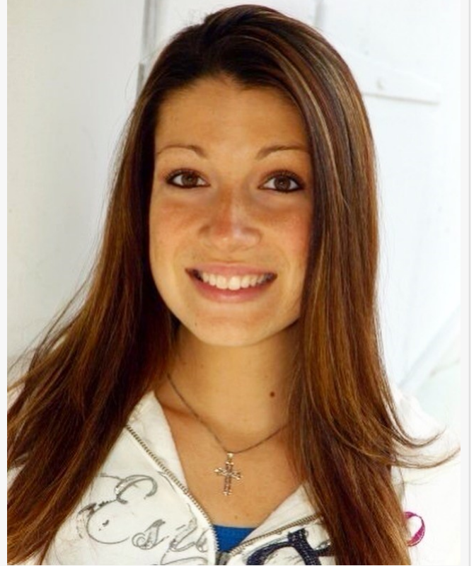
Stacy Padula, Award-winning Author

This press release can be viewed online at: https://www.einpresswire.com/article/538232035