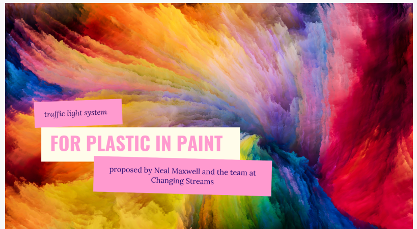
plastic in paint Changing Streams