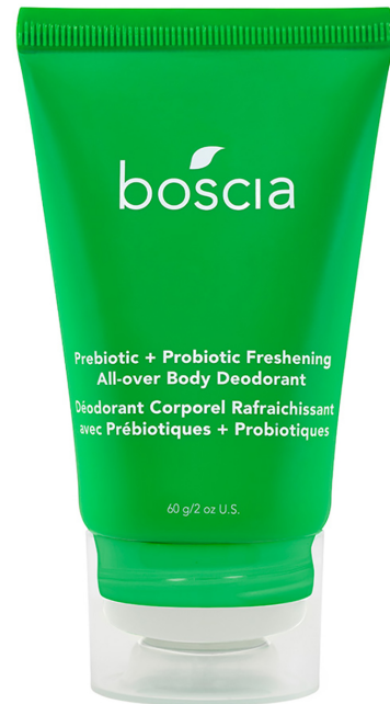
Prebiotic and Probiotic Freshening All Over Body Deodorant