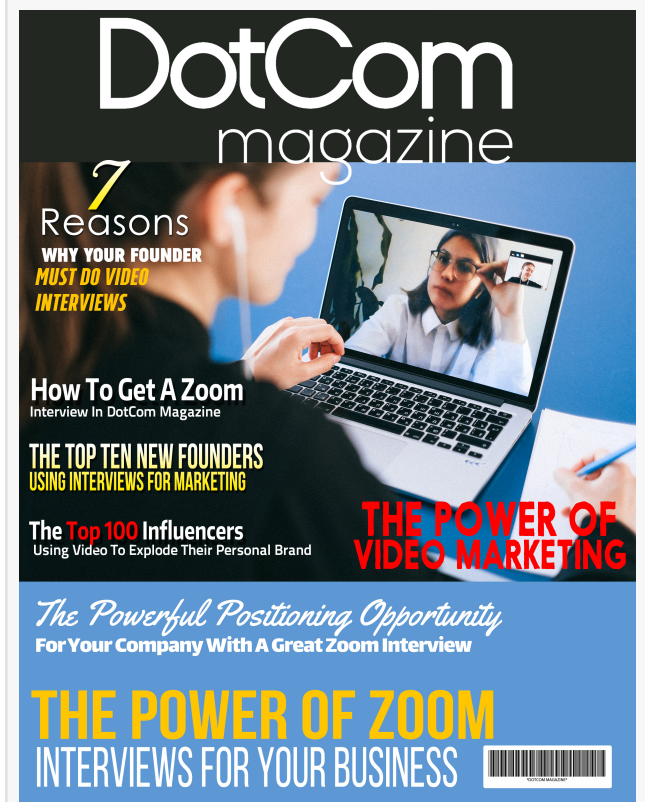
The DotCom Magazine Exclusive Zoom Interview