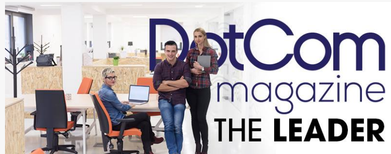
The DotCom Magazine Entrepreneur Spotlight Series