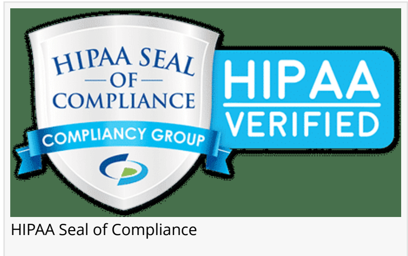
HIPAA Seal of Compliance

Insurance Portability and Accountability Act (HIPAA). Through the use of Compliance Group's proprietary HIPAA verification program, The Guard, NovaBACKUP now holds the Seal of Compliance under their regulatory compliance program.