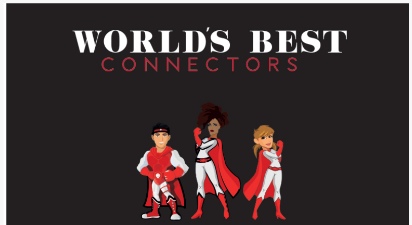
The World's Best Connector LLC

expertise and extensive networks to assemble a powerful collection of top experts to address the serious, but little understood or discussed, topics (e.g., acquisitions & mergers, succession planning, wealth preservation, supply chain management and sustainability) challenging struggling CEOs. In October, WBC’s Annual Conference presented by Arizona State University will focus on "Diversifying Tech Leadership." Executives and business owners can sign up to be alerted about details and schedules of these events via Contact Us on the WBC website.