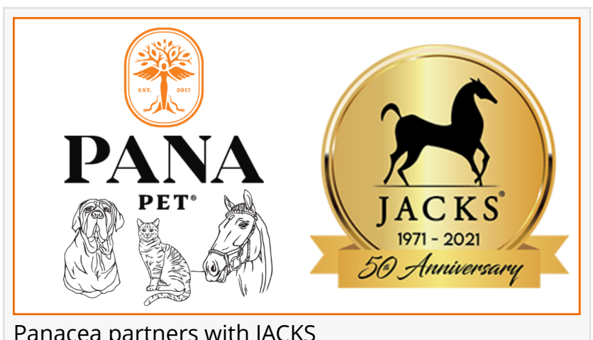
Panacea partners with JACKS

GOLDEN, CO, UNITED STATES, April 13, 2021 /EINPresswire.com/ -- Panacea Life Sciences, Inc. (Panacea), a cGMP certified, vertically integrated premium CBD company located in Golden, Colorado, has partnered with the globally recognized manufacturer and wholesale distributor of equine and