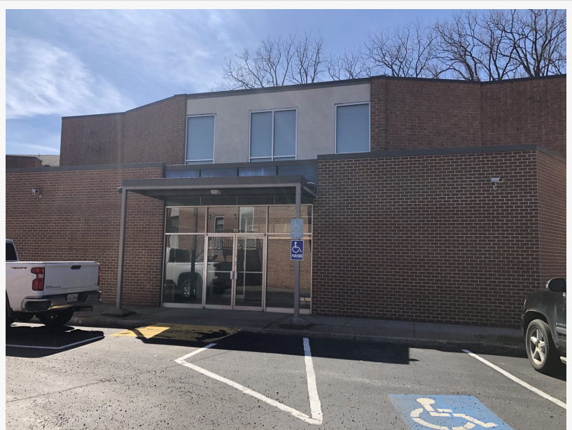
40 Lambert St., Staunton, VA