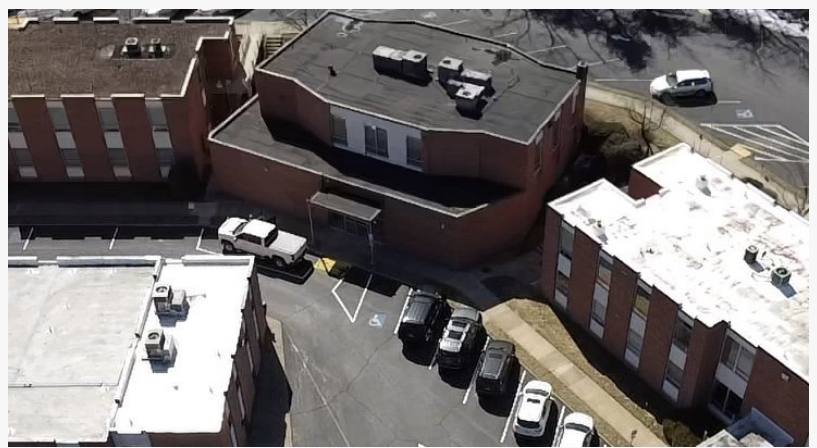
40 Lambert St., Staunton, VA