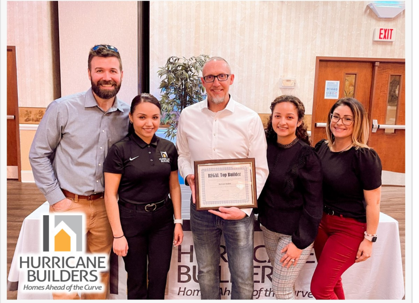
REGAL Top Builder _ Hurricane Builders

receive a "REGAL Top Builder" award; an acknowledgement for their 2020 sales volume for closed homes and for outstanding performance in the sales, marketing and production of new homes in the Greater Columbia area. The award was presented by BIA of Central SC President,