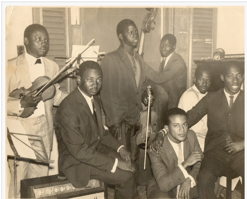
La Maravillas de Mali

Over the years, ArtMattan Films and ADIFF have showcased films focusing on the Afro-Latino experience coming from Cuba, Uruguay, Argentina, Colombia, Chile, Peru, Ecuador, Mexico, Puerto Rico, Haiti, the Dominican Republic, Brazil, and more. Some of those films are brought back in the ADIFF Afro-Latino film series at the end of April which includes special programs such as “Afro-Latino Music of South America” featuring the documentaries Candombe from Uruguay and Susana Baca: Memoria Viva from Peru and the “Afro-Latino History” program with Sons of Benkos from Colombia and The Esmeraldas Beach from Ecuador.