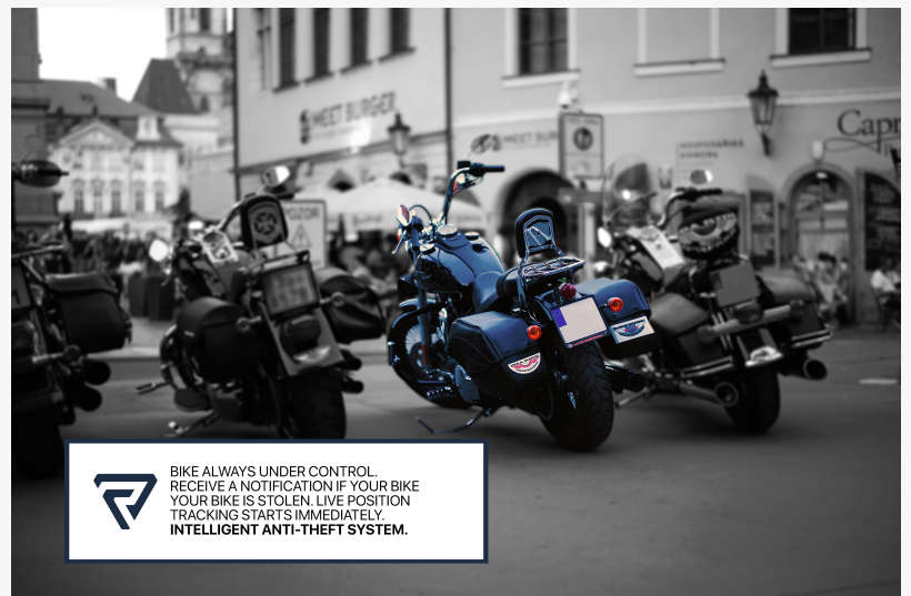
Rideet anti-theft protection