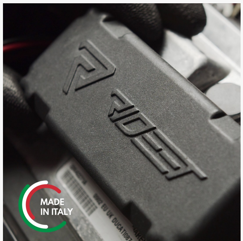
Smart Rideet One black box

Rideet One gives bikers the ability to monitor and analyse their motorbike remotely. Simply connect it to the 12V battery, install the app, download data about the motorbike from the manufacturer's database and you're ready to go. Thanks to its IP69K protection class, Rideet can even withstand high-pressure cleaners. The assistant, developed and designed in Italy, is Amazon Alexa-compatible, so bikers can conveniently ask Alexa about the condition of the motorbike battery, the last ride or the next service appointment. Thanks to GPS, GLONASS and smart sensors, the maximum speed, acceleration and lean angle can be tracked. For sporty drivers, there is also a drag mode. This measures the acceleration times from 0-100km/h or 0-200 km/h.