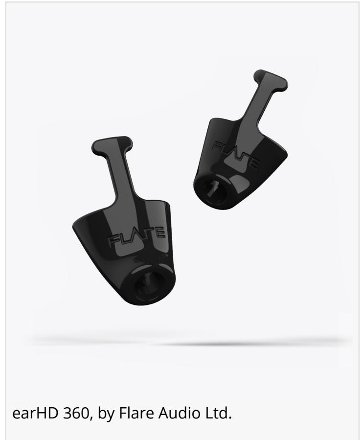
earHD 360, by Flare Audio Ltd.

earHD 360 was developed from Flare's anti-resonance technology originally found in their popular stress-reducing product, Calmer. Following Calmer's success, earHD 360 was developed specifically to enhance musical experiences.