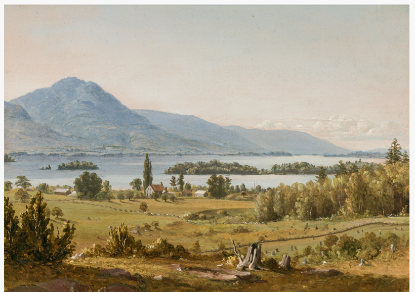
Oil on canvas mounted on paperboard by Sanford Robinson Gifford (American, 1823-1880), titled Lake George from Near Sabbath Day Point, 10 ¾ inches by 14 ¾ inches (est. $30,000 - $50,000).