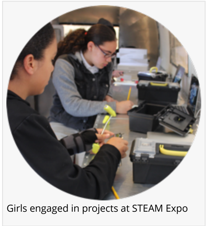
Girls engaged in projects at STEAM Expo

Students Think STEAM EXPO is a program of National College Resources Foundation (NCRF), a 501c3 non-profit organization that functions daily as a full service student outreach program in various schools throughout California. NCRF's mission is to curtail the high school dropout rate and increase degree and/or certificate enrollment among underserved, underrepresented, at risk, low resource, homeless and foster students. NCRF's vision is to close the gap in educational achievement, workforce and economic disparities with the goal to end racism and racial inequalities.