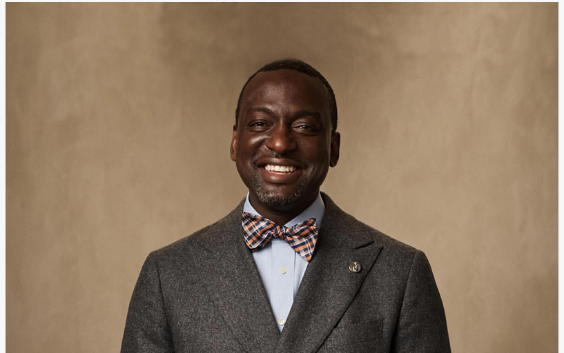
Dr. Yusef Salaam