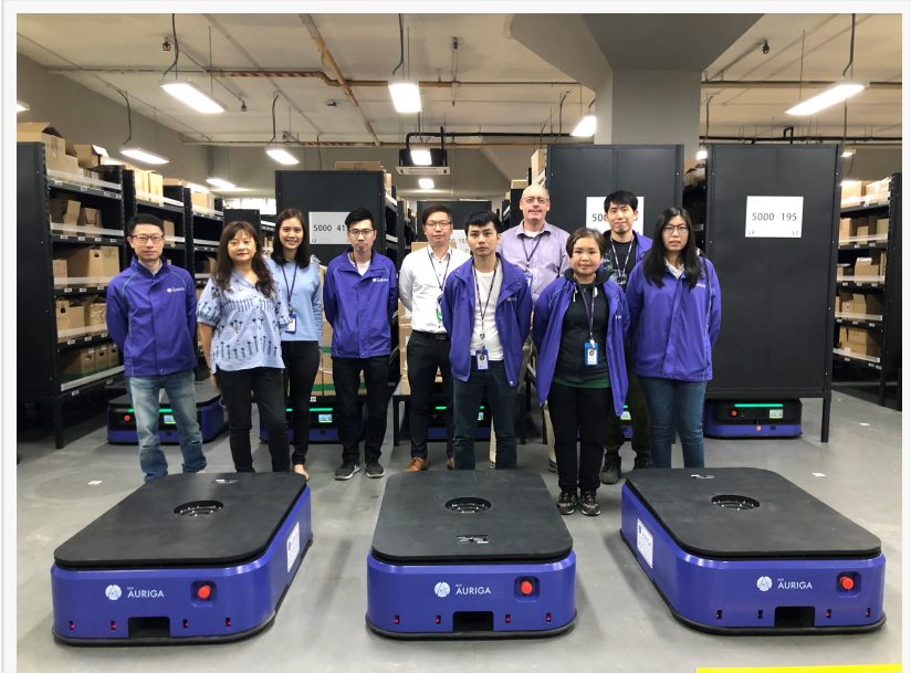
DCH Auriga Embarks On Robotics Warehouse Operation With the AC2 Group

"Significant effort has gone into ensuring the warehouse robots, i.e. automatic guided vehicles (AGV), integrate seamlessly with DCH Auriga's existing warehouse management system (WMS). The warehouse robots handle the execution of tasks while the WMS continues to manage business rules, operation strategies and inventory management. While gaining higher operation